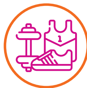
VCE/VET Sport & Recreation Knowledge