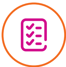
SACs & Practice Exams